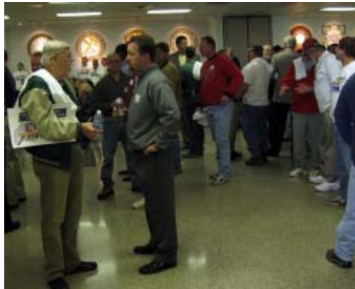
Members gather before the rally in Cleveland, OH in support of Issue 3 and 34,000 good, Ohio jobs.

members to vote early and at the polls was on par with the 2008 election, and many labor leaders saw the job creation and private investments too good to pass up this time around.