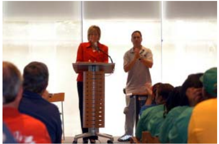
Congresswoman Betty Sutton (D-13th) spoke to hundreds of union members in Washington, D.C., before members rallied for health insurance reform in June of this year.

"Today, we passed a health care bill that will work for and with the American people. This bill will provide Americans with access to more affordable, quality care they can count on. The American people have been waiting for us to put an end to the egregious,